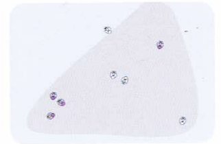
Barnacles and other macro-fouling: no more than 5% coverage including niches